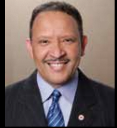
Marc H. Morial President & CEO

A handwritten signature in black ink, appearing to read "Marc H. Morial".