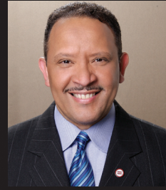
Marc H. Morial President & CEO