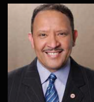
Marc H. Morial President & CEO